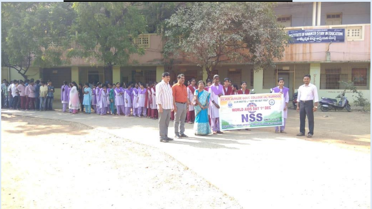
NSS volunteers started as a rally from college for creating awareness on AIDS