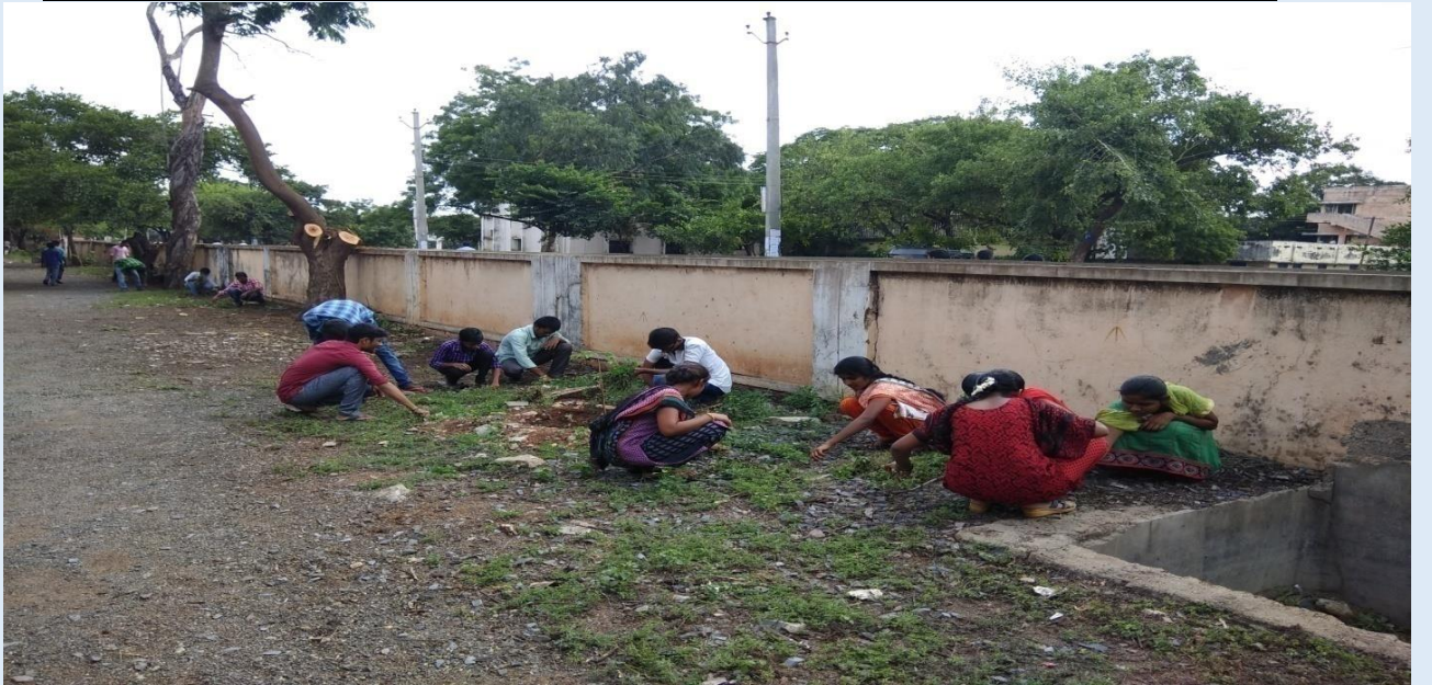
Volunteers cleaning premises in front of commerce department