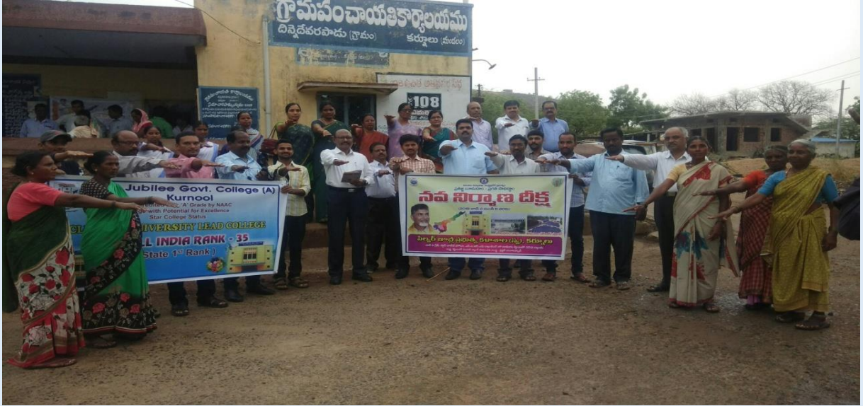
Nava nirmana deeskha Oath by principal sir along with staff members and villagers