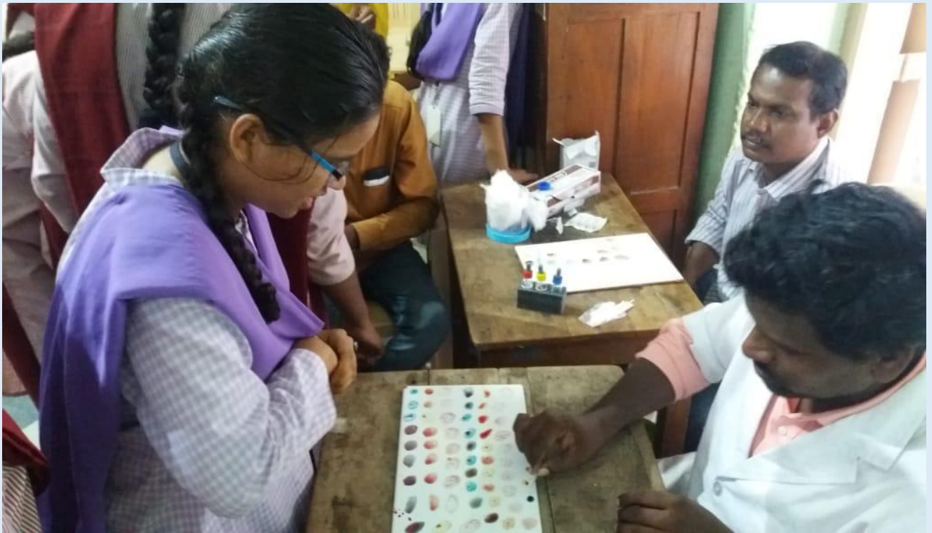
Taking blood samples of NSS volunteers