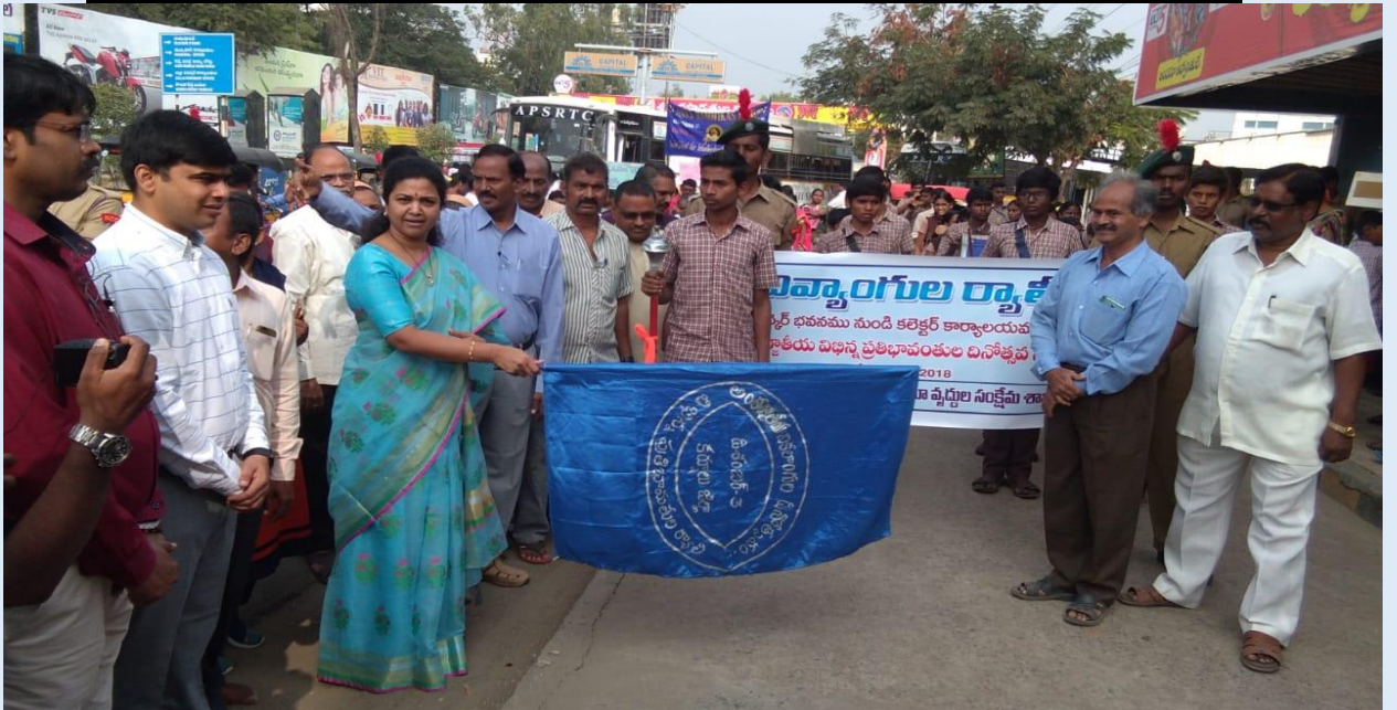
Kurnool MP Bhutta renuka started the rally