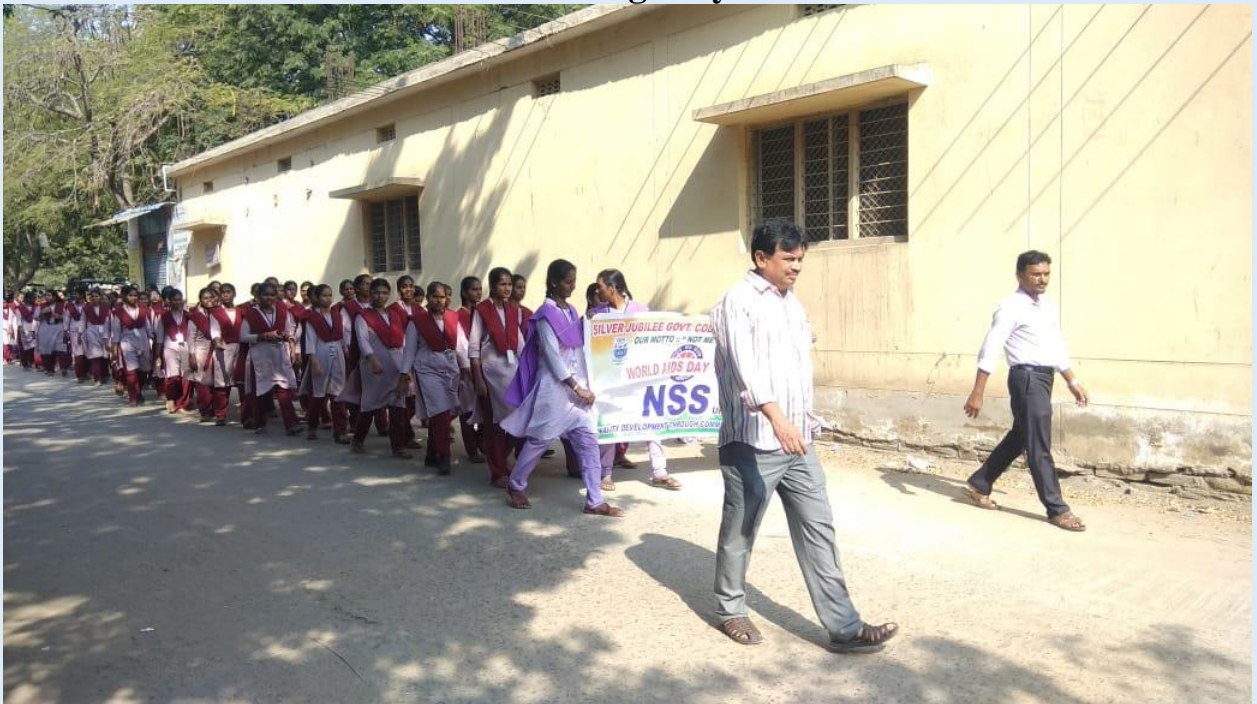
A photo click while volunteers going to collectorate office as part of AIDS awareness