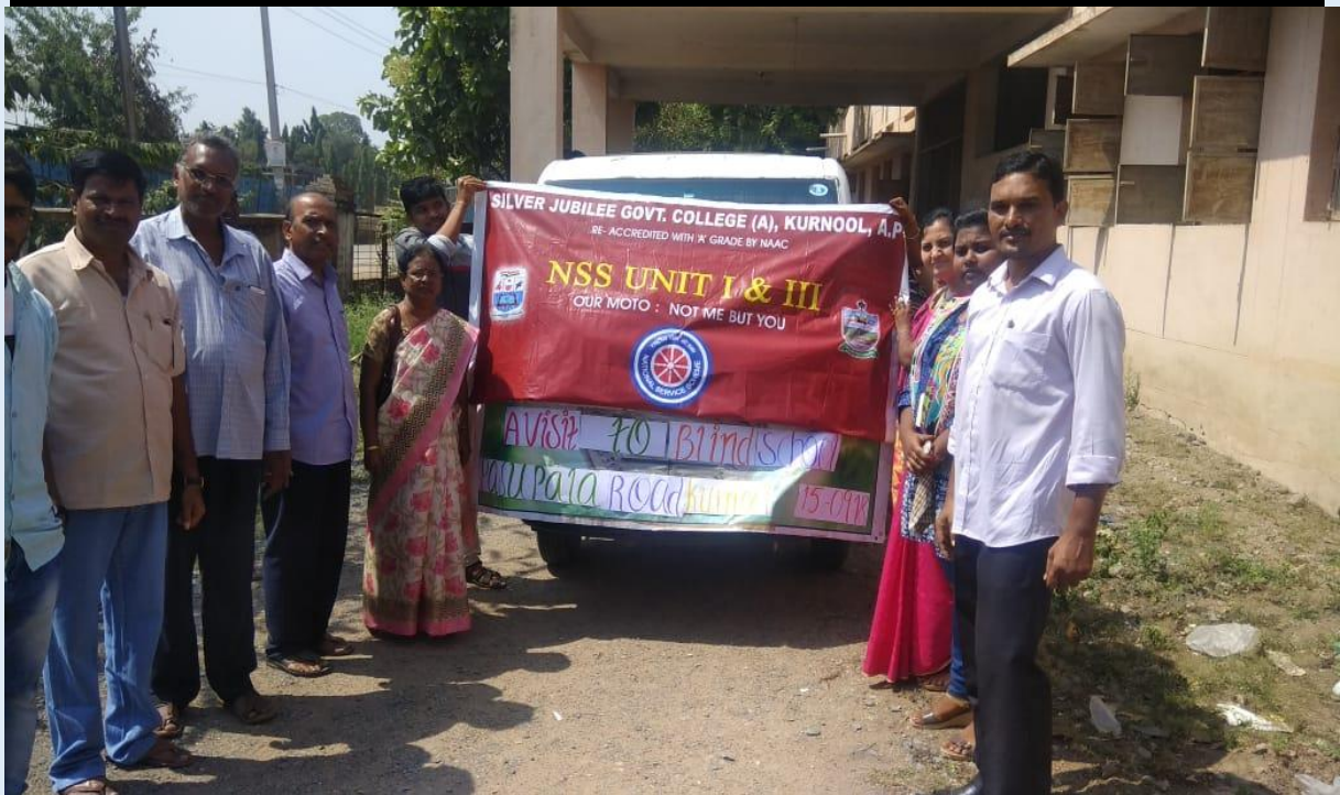
NSS po sir, principal madam, all other commerce department staff and students are going to the blind school