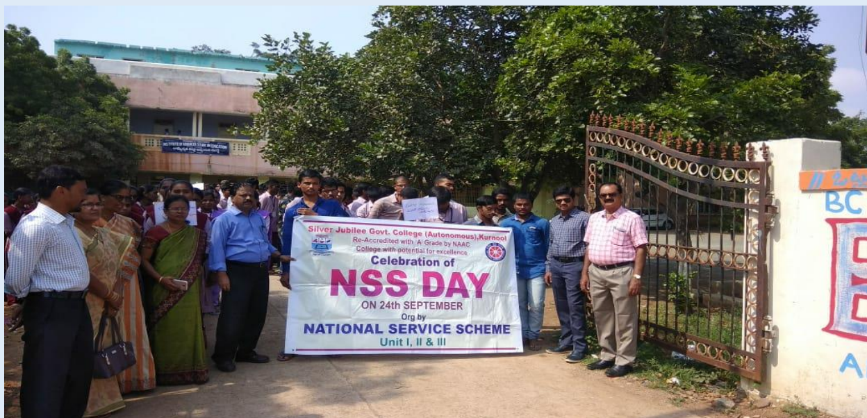
As part of NSS day all lecturers and students going to rally