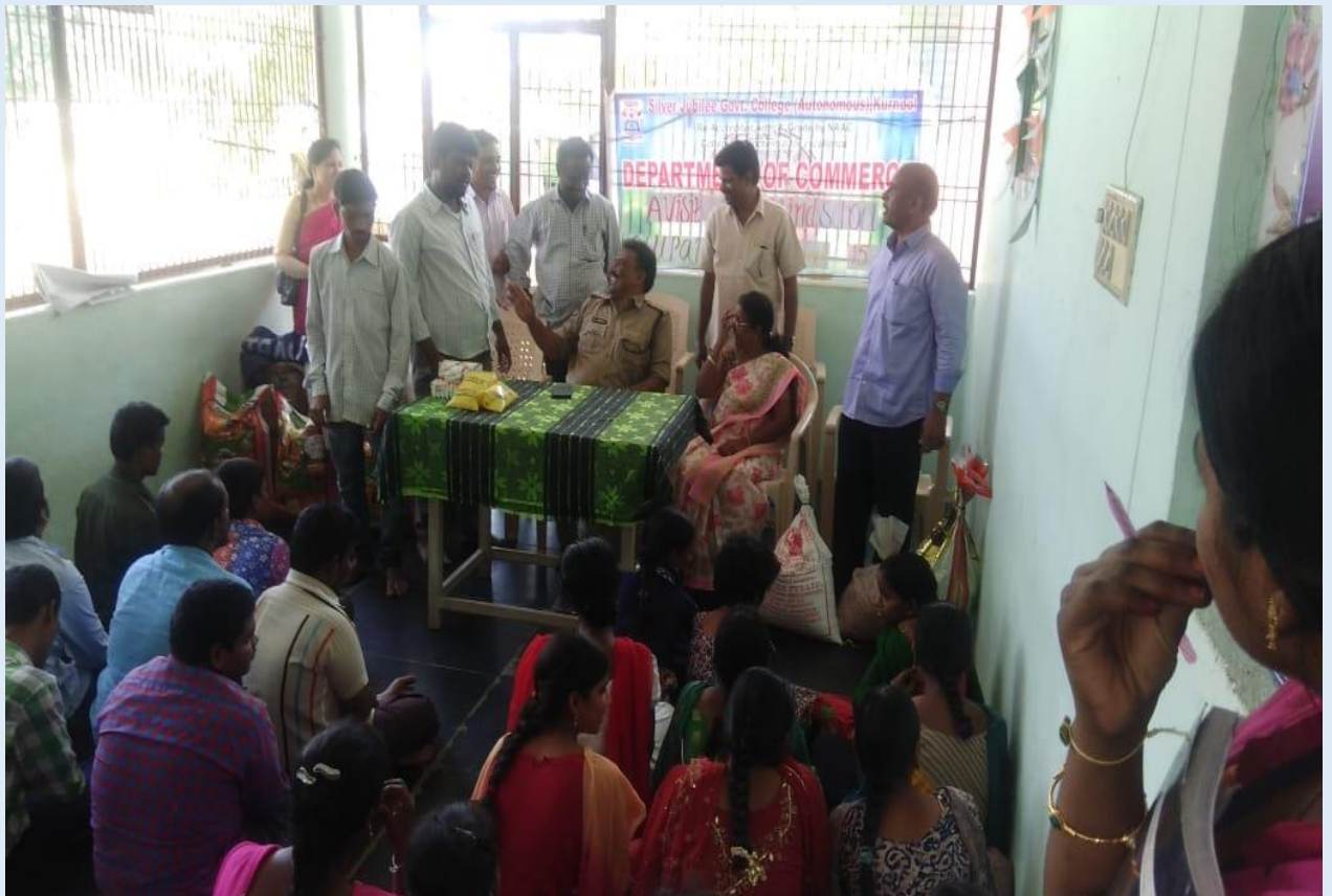
Our DSP interacted with the blind students