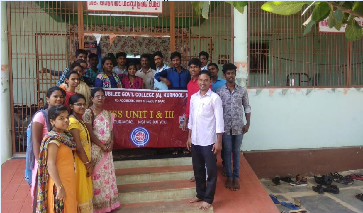
In Aksara Bhavan blind school at Pasupula road