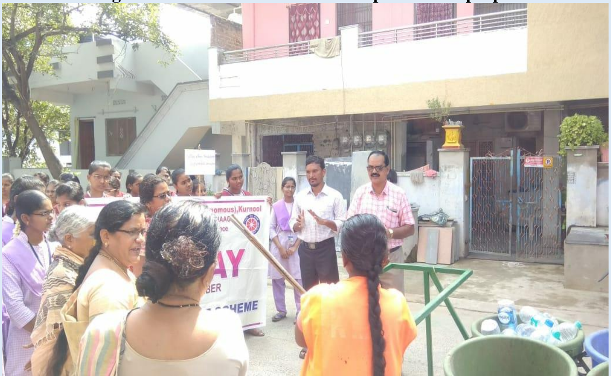
NSS PO'S and students giving awareness to people