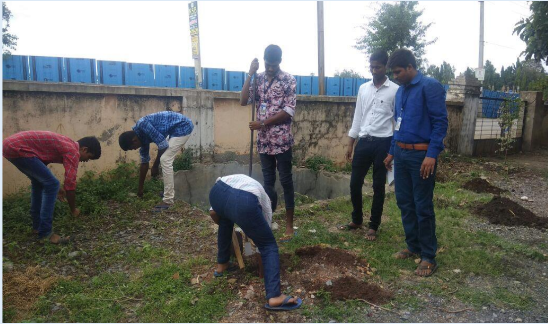
NSS volunteers actively participating in digging programme