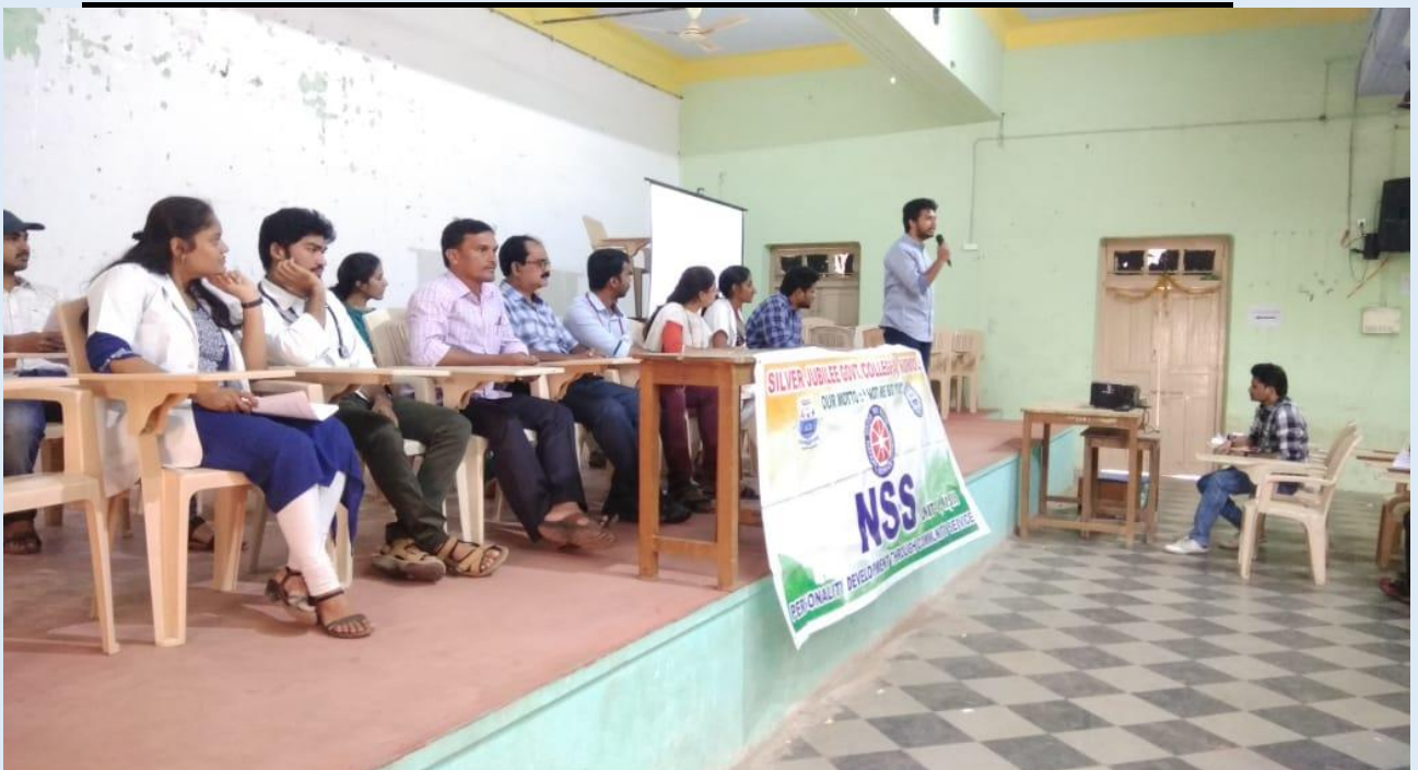
Medical college student awaring the NSS volunteers on health