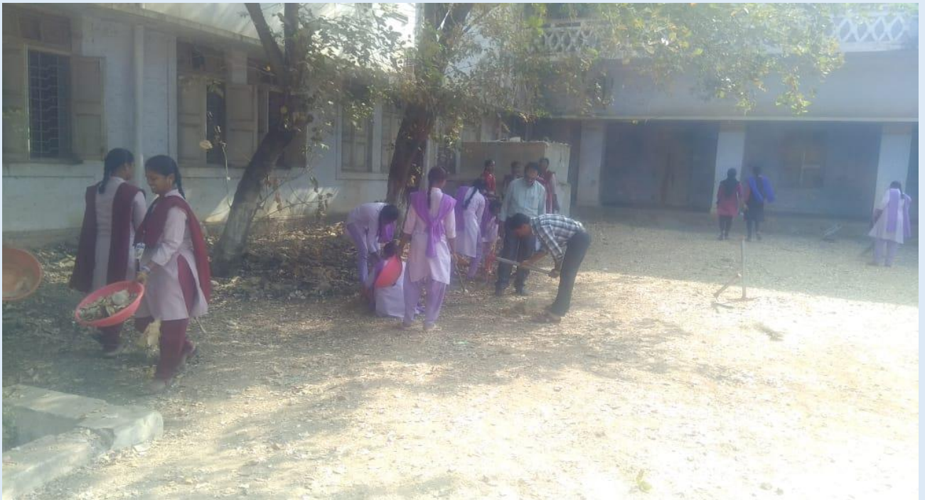
Cleaning in front of library for republic day program