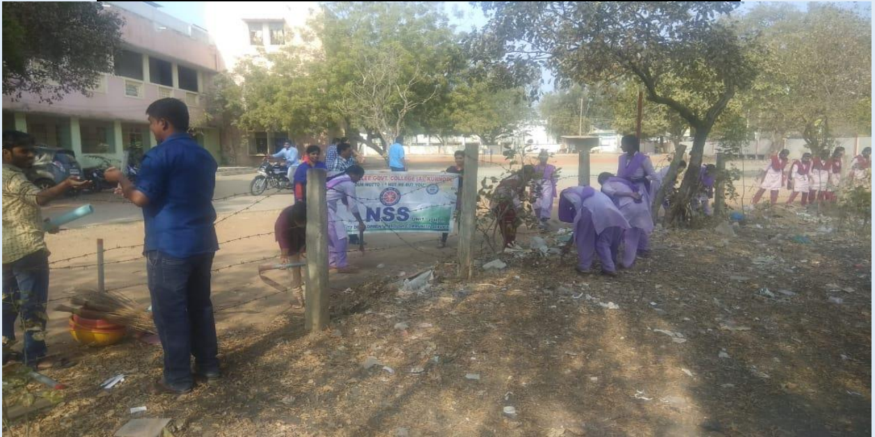
NSS volunteers cleaning the college premises