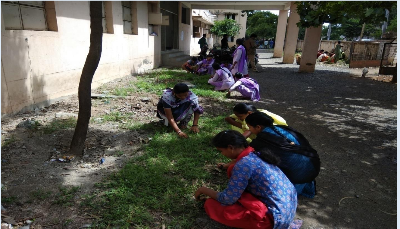
volunteers cleaning and removing weeds