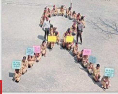
ఎయిడ్స్ చిహ్నం ఆకారంలో సిల్వర్ జూబ్లీ విద్యార్థులు