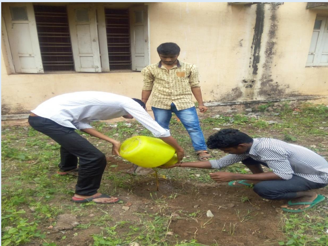
NSS volunteers watering to the plants after plantation