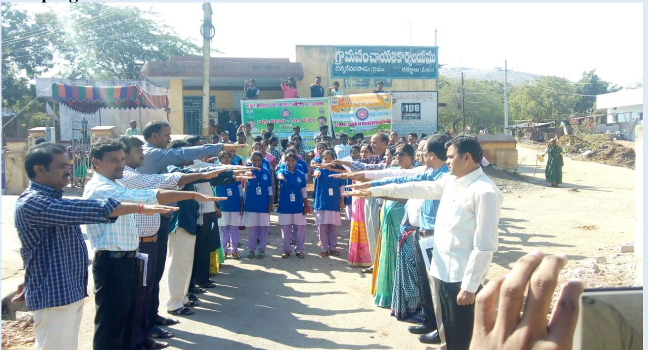
Volunteers taking oath as part of janma bhoomi maa ooru