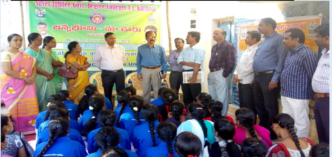
Vice chancellor and register of R.U attended for the janma bhoomi maa ooru program