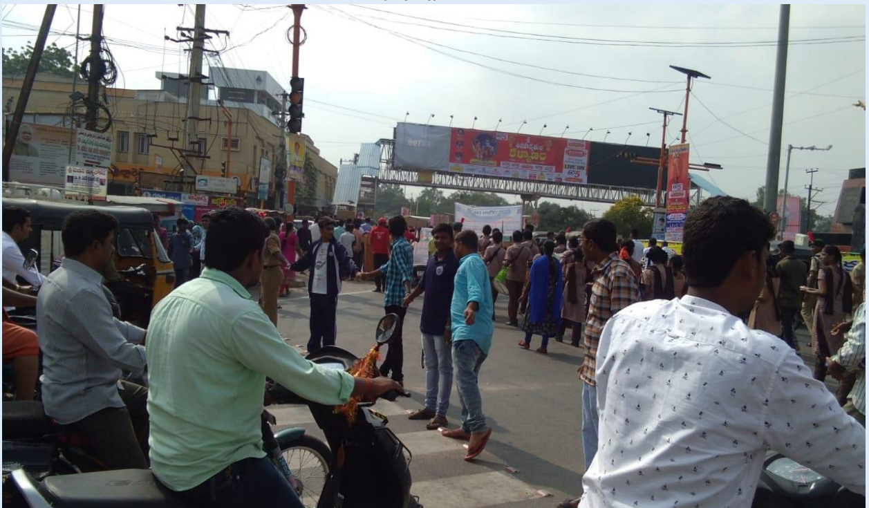
NSS volunteers regulating the traffic near collectorate office as part of rally