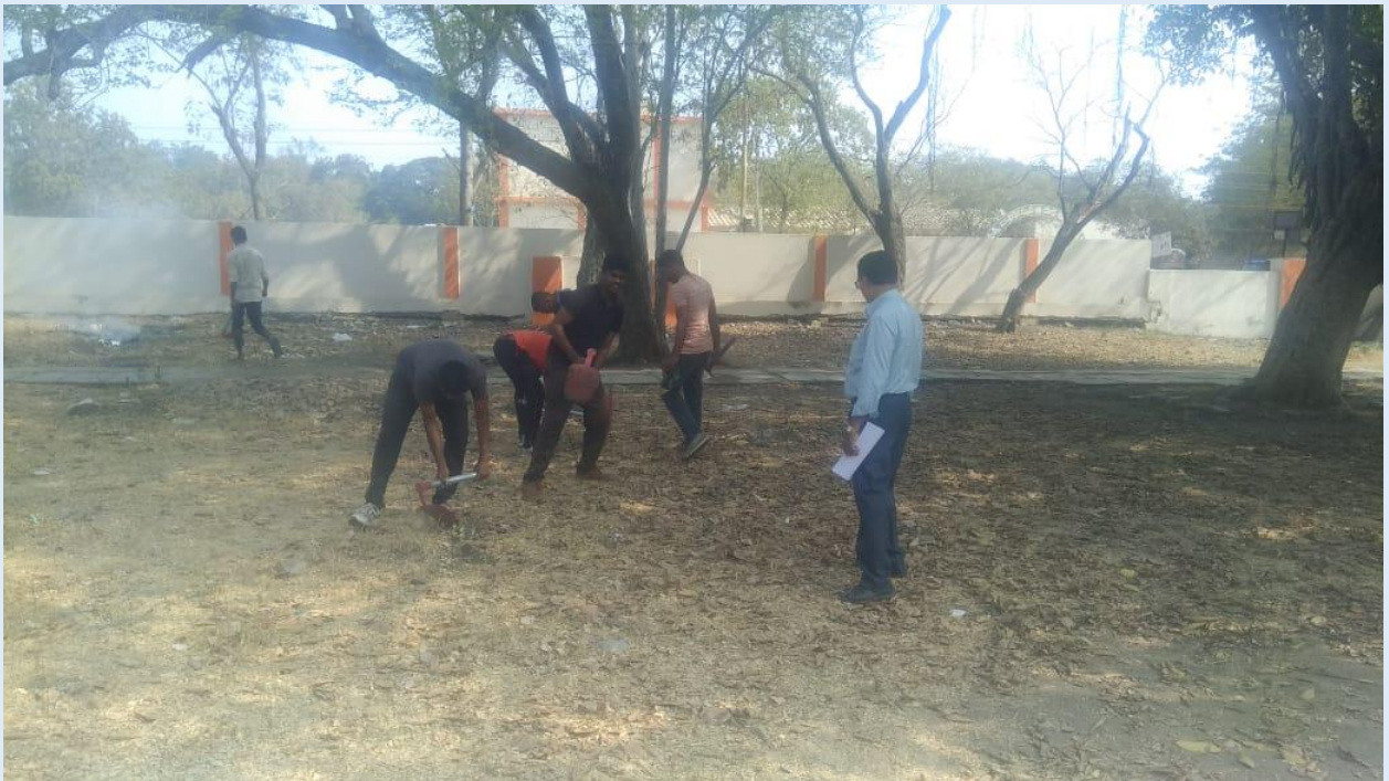
Volunteers removing the dry leaves in front of college