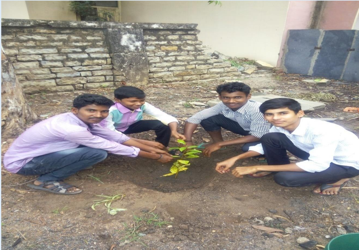
NSS volunteers planting a plant as part of vanam manam