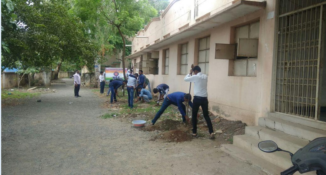
Digging pits for plantation in front of commerce department