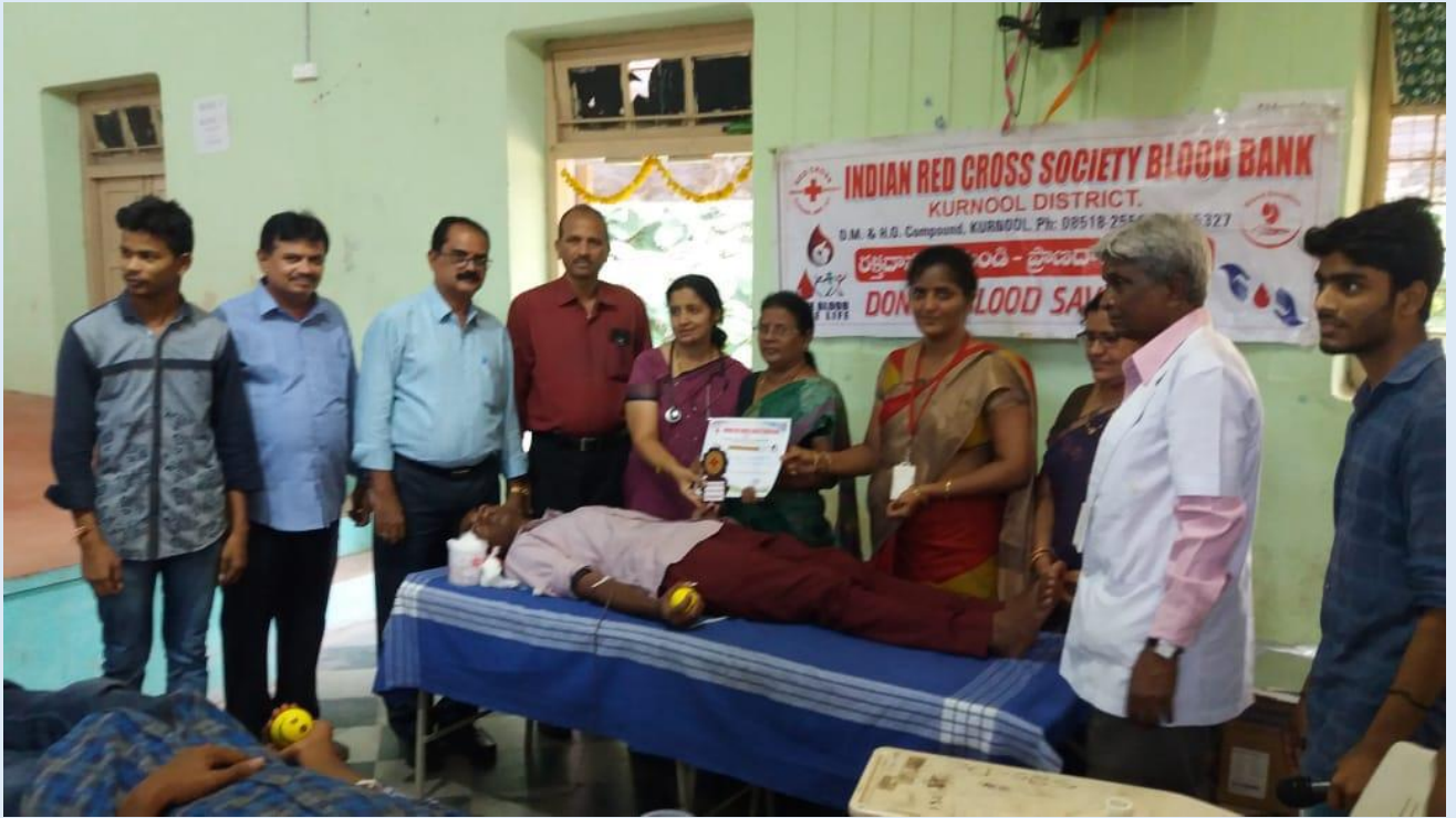
Blood donation by NSS volunteers321]