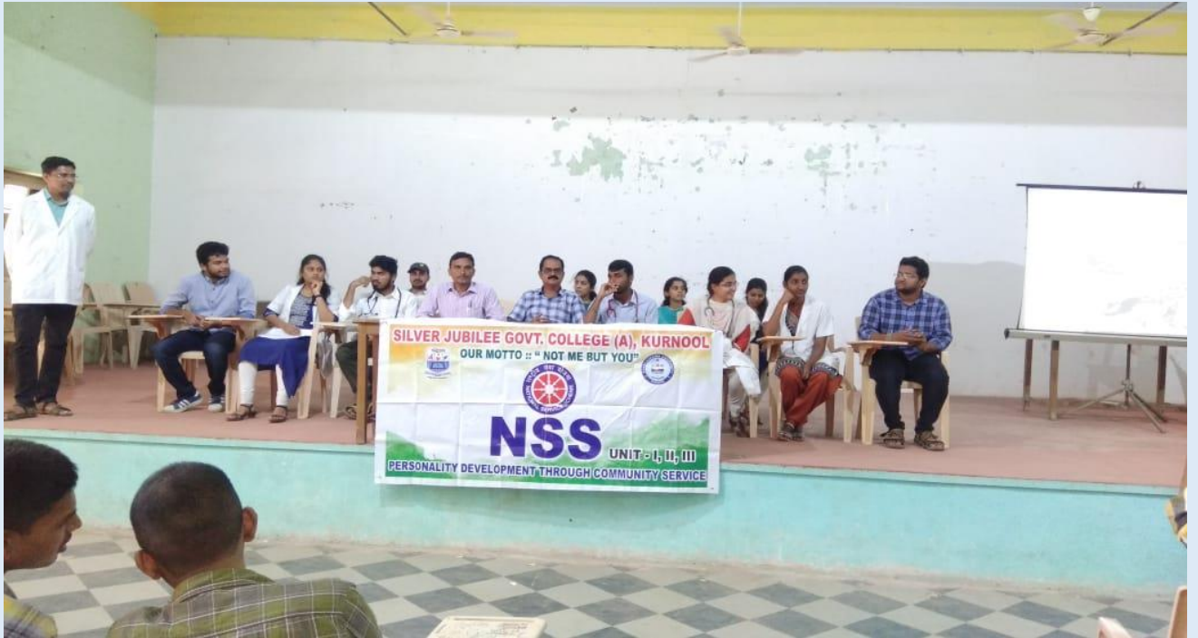
Health awareness program by medical college students in silver jubilee auditorium