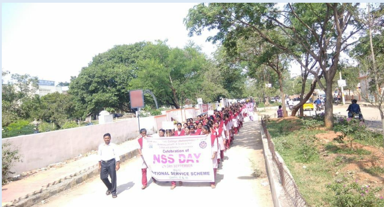
A photo click while rally on NSS day