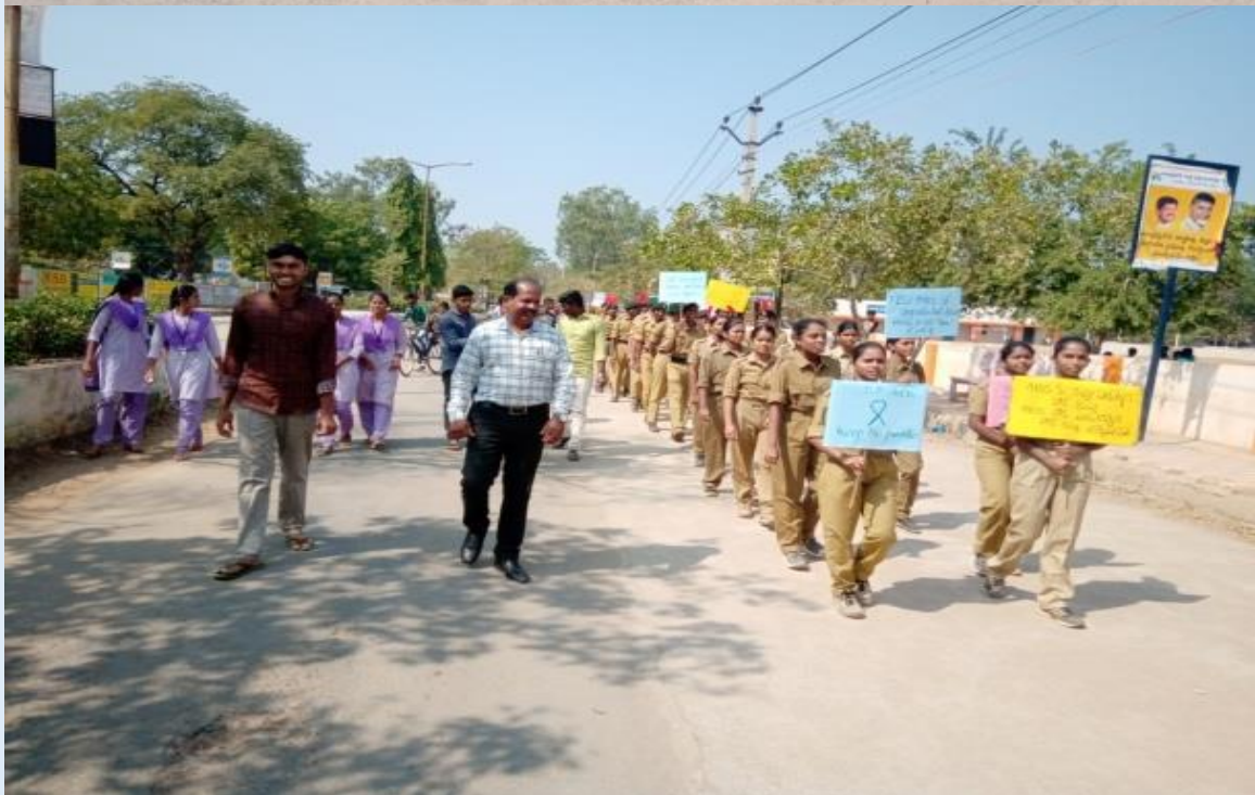
AIDS SYMBOL BY SW CADETS