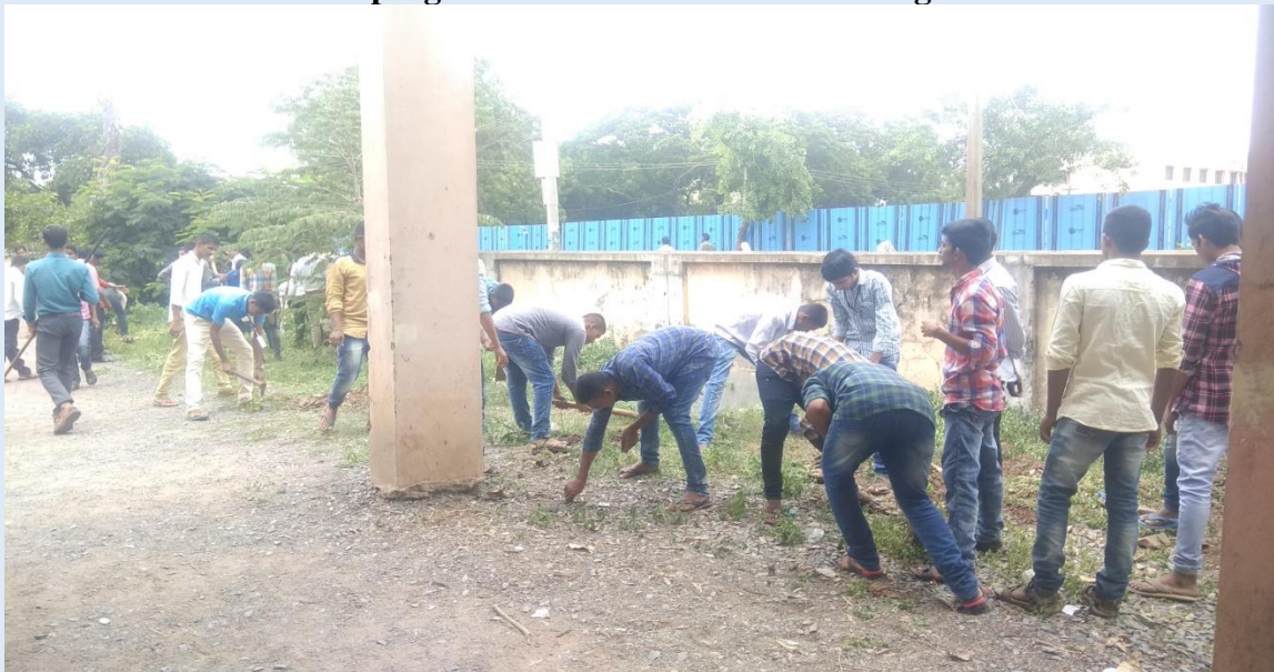
NSS volunteers are actively participated in swachh bharath program to clean the college