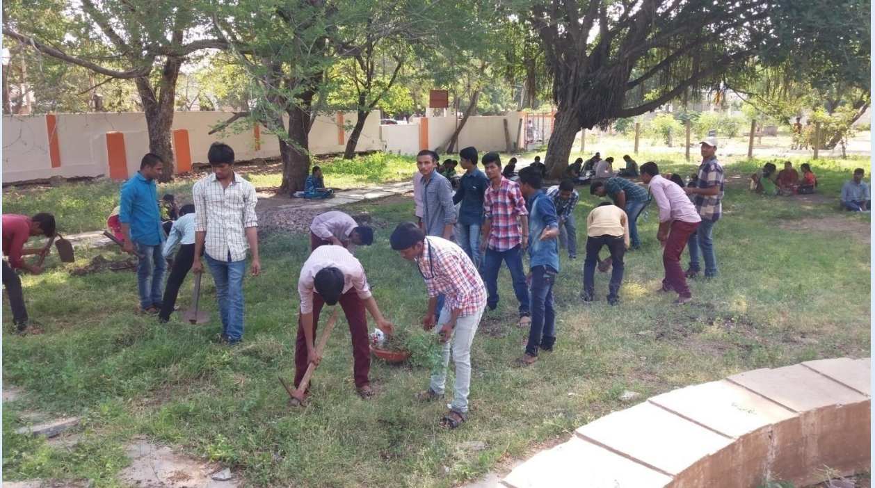
Manam-Vanam Programme in silver jubilee govt degree college,(A) , Kurnool.