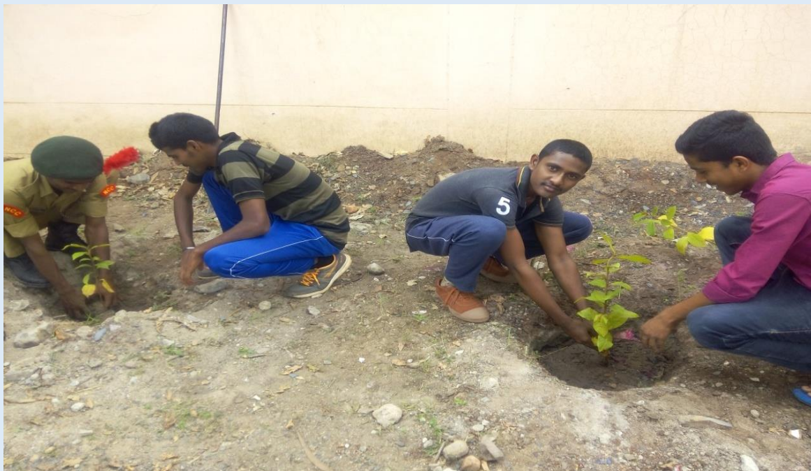
Students actively participating in program of vana