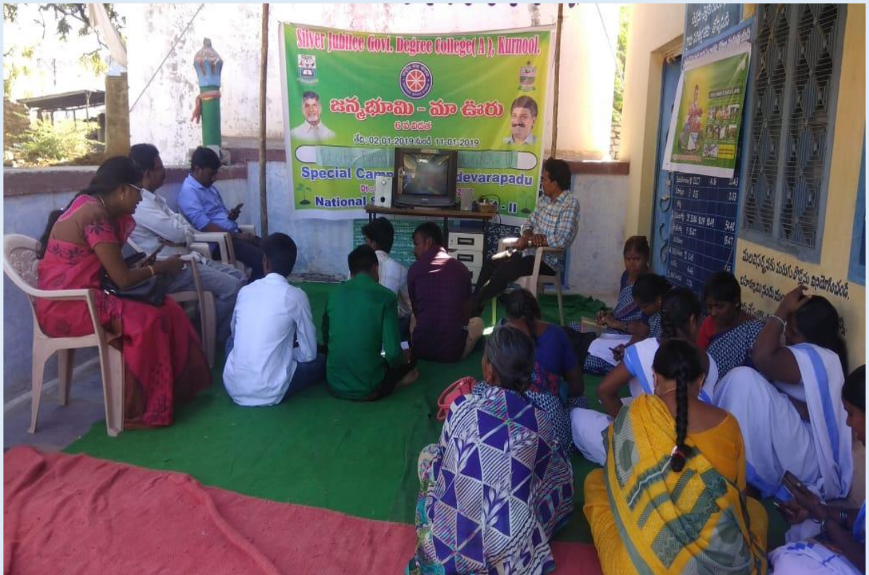
AP CM live telecast on the janma bhoomi maa oorun program