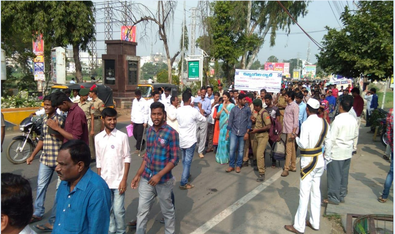
Rally conducted on disability day ,Kurnool loksabha MP Butta Renuka participated in the rally