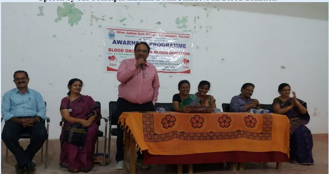
Awareness by DMHO on blood grouping and blood donation