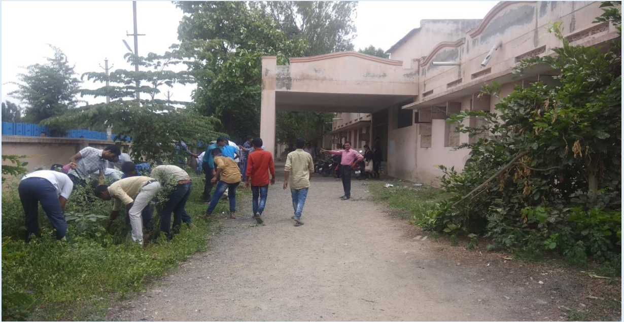
Swachh Bharath program was conducted in our college on 30-06-2018