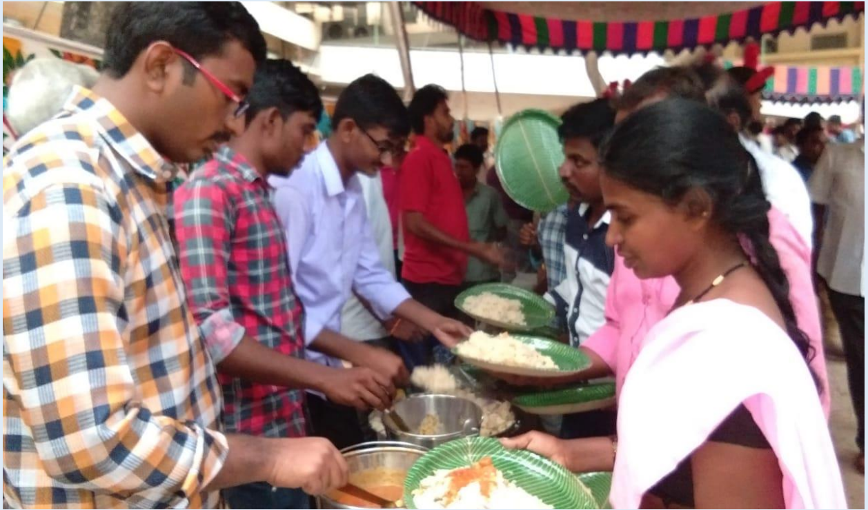
NSS volunteers serving to the disabled people on the day of disability