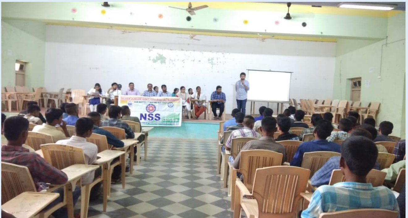
NSS Volunteers participated in the program conducted by the medical college students