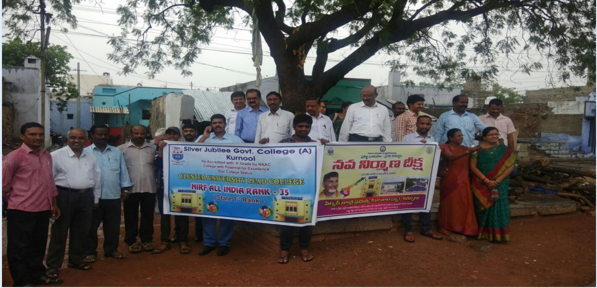
Our college principal and staff members gives awareness to the villagers on newly formation of andra Pradesh state